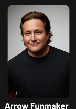
Thundermaker Cultural Recovery