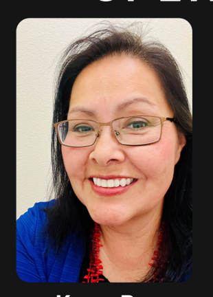
Karra Papa Native American Fatherhood & Families Association