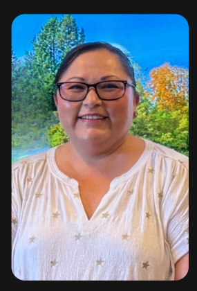
Estefanita Calabaza Santo Domingo Pueblo: Prevention Program